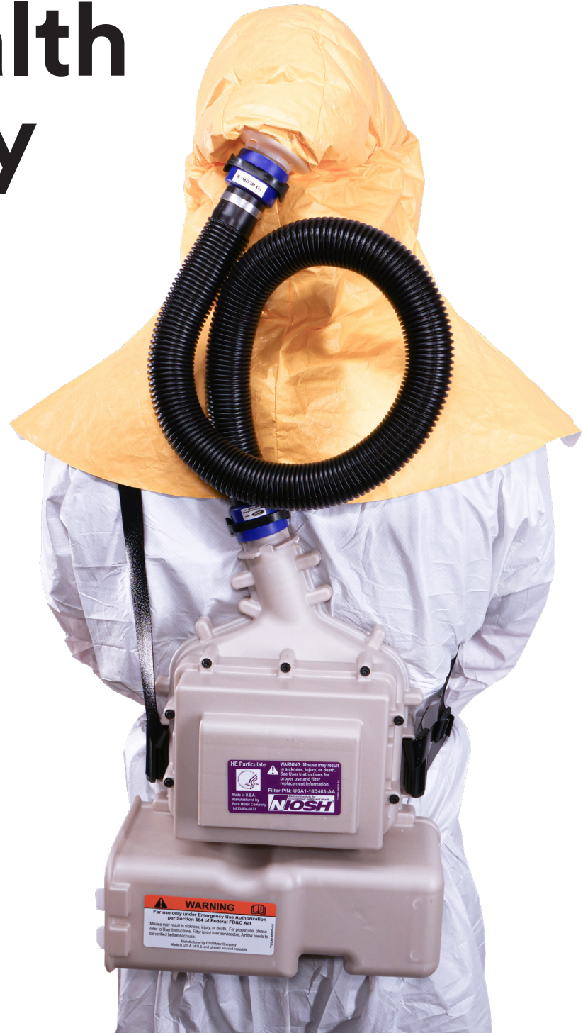
PAPR system being worn by worker