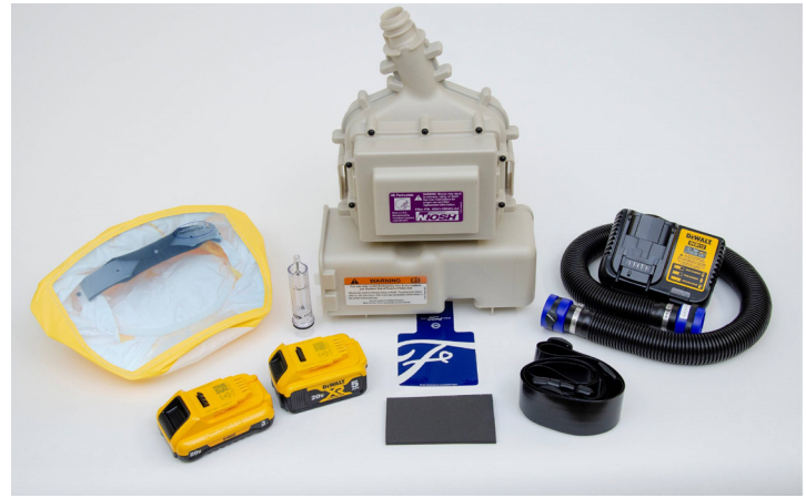
Ford® Limited-Use Public Health Emergency PAPR Kit

Limited-Use Public Health Emergency PAPR vs. 3M™ Versaflo™ TR-300+ PAPR